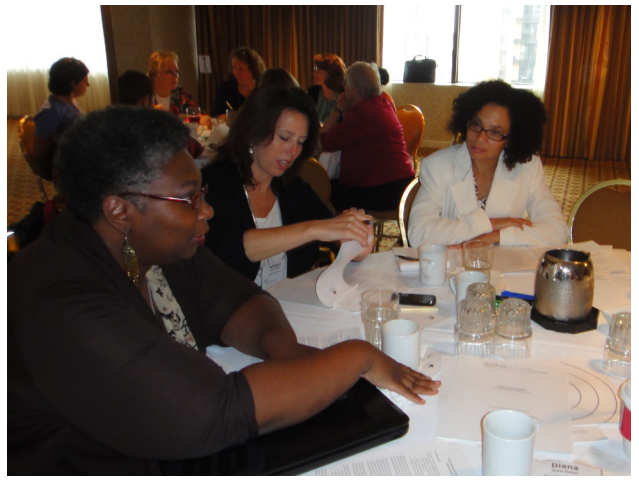
"Advancing Continuity of Breastfeeding Care for All" Stakeholders Meeting, August 2013