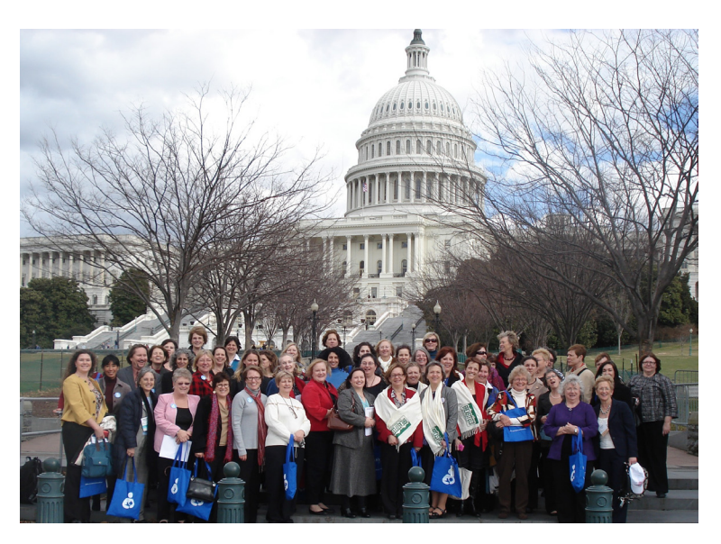
USBC Advocacy Day, August 2010