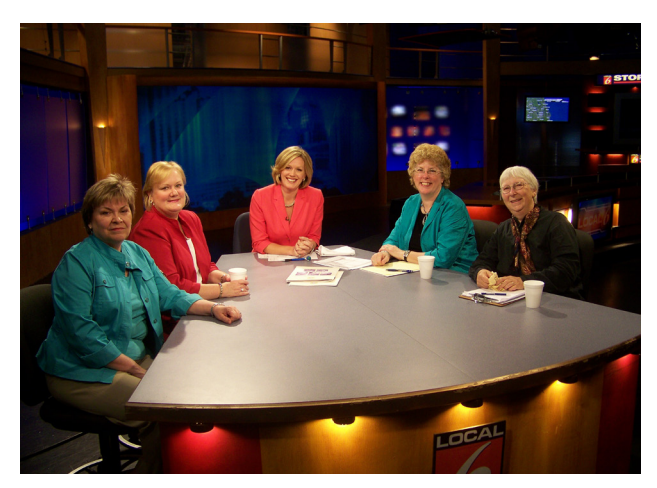
USBC leaders on local news show, WKMG's Flashpoint, July 2009